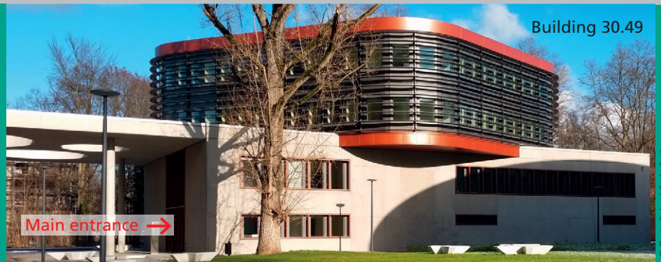
Fraunhofer IWM, MicroTribology Center \mu TC, Karlsruhe.

A COOPERATION BETWEEN THE FRAUNHOFER IWM AND THE KARLSRUHER INSTITUTE FOR TECHNOLOGY KIT IAM