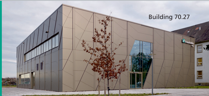
Fraunhofer IWM, MicroTribology Center \mu TC, Karlsruhe.

A COOPERATION BETWEEN THE FRAUNHOFER IWM AND THE KARLSRUHER INSTITUTE FOR TECHNOLOGY KIT IAM